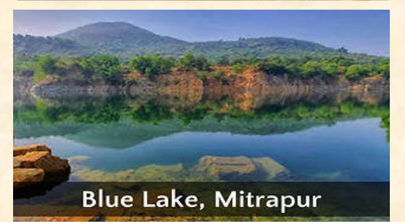
Blue Lake, Mitrapur