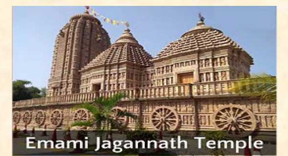
Emami Jagannath Temple