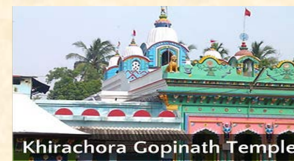
Khirachora Gopinath Temple

Khirachora Gopinath Temple (7 KM), Chandipur Beach (15 KM), Maninageswari Temples (20 KM), Bhudhar Chandi Temple (25 KM), Panchalingaswer Temple (30 KM), Dagara Beach (60 KM), Raibanei Durg (65 KM), Chandaneswer Temple (90 KM), Talsari Beach (95 KM). Emami Jagannath Temple (10 KM). Local tour operators can be arranged on request for a visit to these places with extra payments.