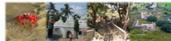
Tourist Places of Interest-Balasore District