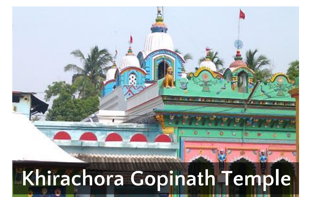
Khirachora Gopinath Temple