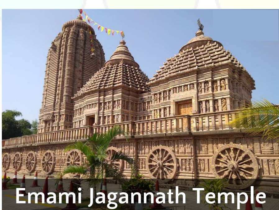
Emami Jagannath Temple