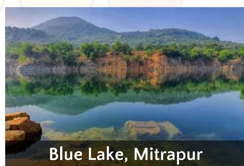
Blue Lake, Mitrapur