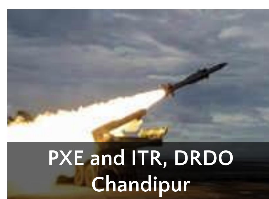
PXE and ITR, DRDO Chandipur