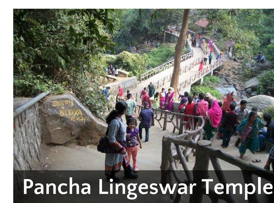
Pancha Lingeswar Temple