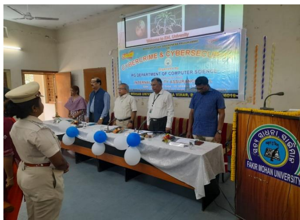
Fig.1. Recitation of the University Anthem

The programme started by lightening the holy lamp by the dignitaries followed by recitation of the University Anthem (Fig.1).