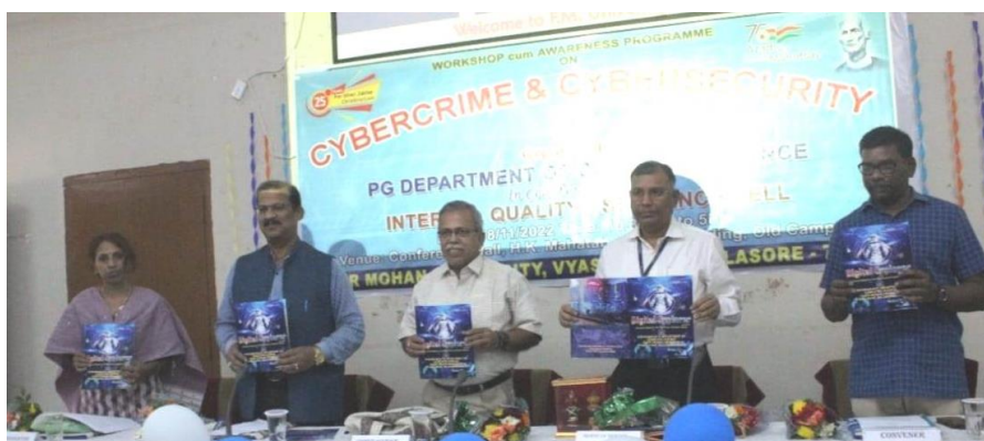
Fig.4. Release of the Digital Explorer