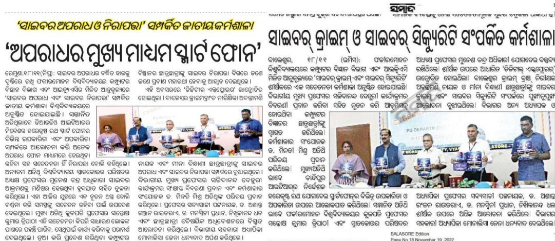
Fig.7. News covered by Odia daily, The Samaj